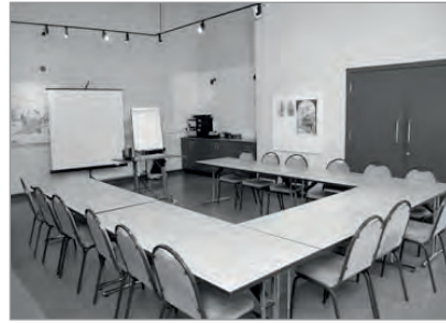
Education Room up to 24 delegates