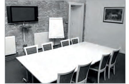
Coach House up to 16 delegates