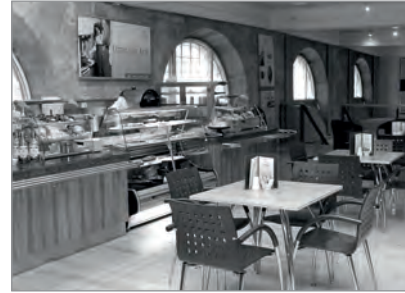
Mezzanine Café 44 seats